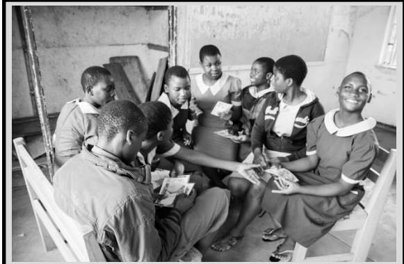
HIV and Water & Sanitation in Malawi

Similar to year 1, weaving health programming into all Special Olympics activities and engaging health advocates, such as family members, coaches, and athlete leaders, to promote improved health among athletes, were considered by many