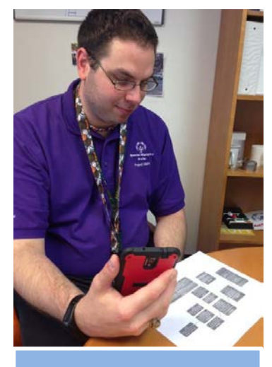
Utilizing SMS to send referrals and health messages to athletes.