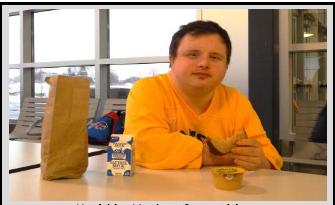
Healthier Meals at Competitions

Special Olympics Programs are providing healthier meals at competitions. Programs are working with local partners to donate free food to events. New York has found a way to continue this cost-saving approach while at the same time encouraging organizations to donate more nutritious options by sharing guidelines that most organizations embrace based on the USDA National School Lunch Program Standards and the Dietary Guidelines for Americans. The Genesee Region in New York has been using the healthy meal guidelines for almost a year now and a lot of progress has been made including at the Super-Regional Floor Hockey event in New York pictured above.