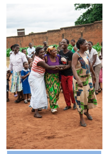
Mothers in Malawi express joy in seeing the achievements of their children with ID.